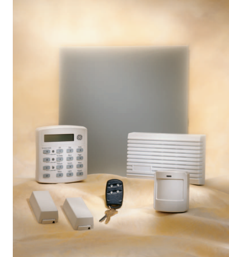
GE Concord security system

Emergency Alarms send a panic signal to the proper authorities. Sirens sound and help is summoned.